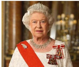
Queen Elizabeth II